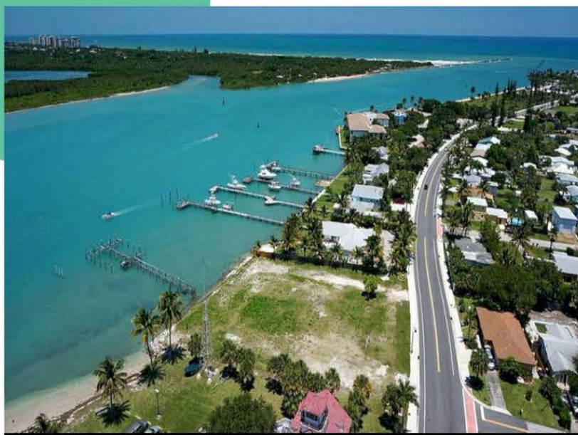
Jimmy Buffet Memorial Highway, Fort Pierce