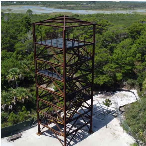
Walton Scrub Observation Tower Construction Progress

photographer, or simply looking for a peaceful outdoor escape, the new observation tower at the Walton Scrub Preserve and natural area promises an unforgettable experience. Stay tuned for Preserve re-opening dates. 10809 South Indian River Drive, Fort Pierce, Fl. 34981 More information on the Walton Scrub Preserve can be found at: https://www.stlucieco.gov/departments-and-services/environmental-resources/county-preserves/walton-scrub