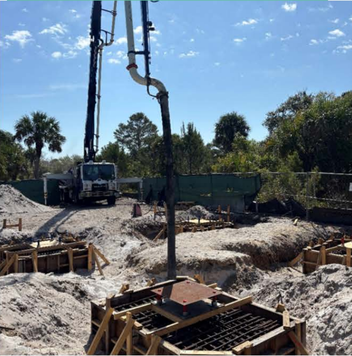
Walton Scrub Observation Tower Construction Progress